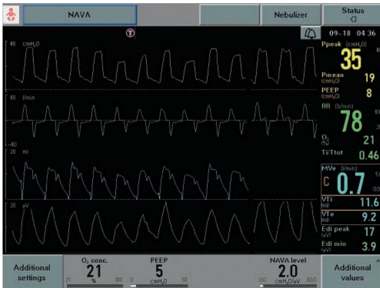
NAVA in a 1 day old 28 week infant with RDS.