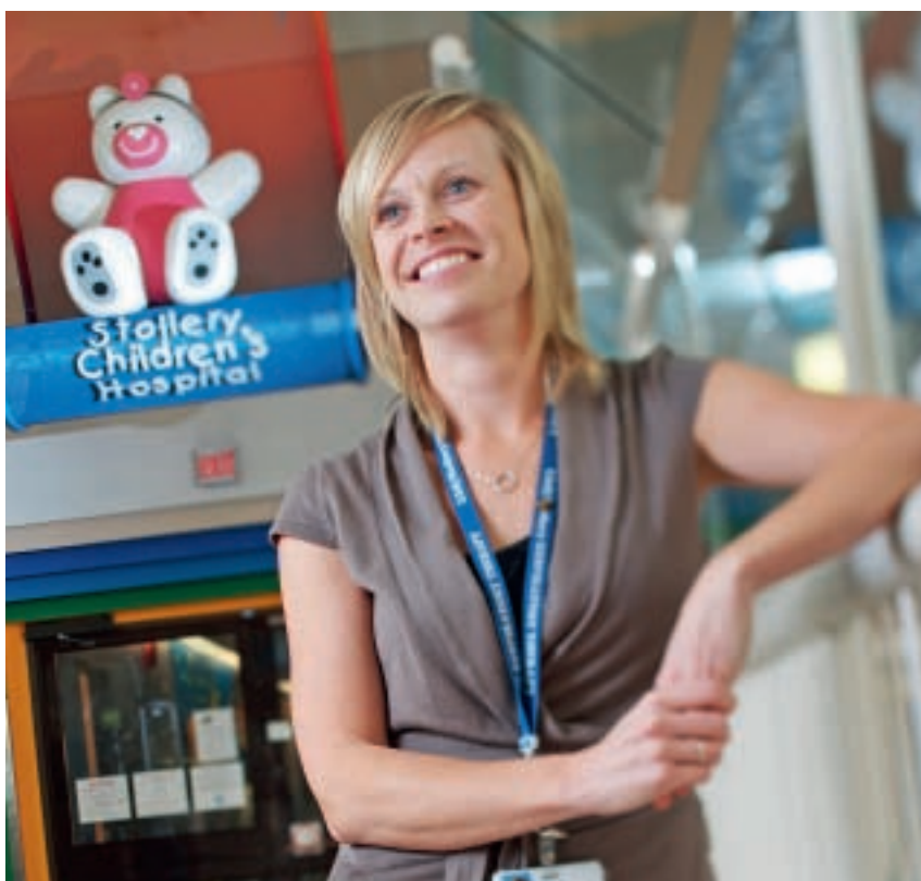
The pediatric and neonatal intensive care units of Stollery Children's Hospital are the next units in line for introduction of NAVA at the University of Alberta Hospital in Edmonton.