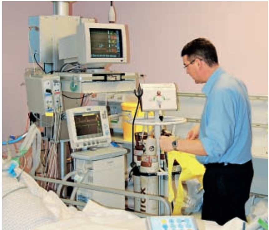
The Heliox Changeover Station has been developed by Ece Medical and BOC Medical with a selector switch for cylinders and pressure indicator as well as gas outlet. The ICU at St Peter's Hospital will soon have Heliox piped supply directly to 5 patient bed-sides.

hours of intensive care, stabilize them generally depending on their condition, and then randomize them to receive Heliox or Nitrox mixtures, and look at the change in plateau pressures over that four hour period. The nice thing with Heliox is once you get nitrogen washout, which takes 3-4 minutes in a closed circuit, you will see if Heliox has an effect or not almost immediately, it is a mechanical thing in the short term. I genuinely believe that we will see a difference within four hours. We have had enough experience at this point to be optimistic to be able to demonstrate a reduction in pressures. We will be looking at patients with \text{PaO}_2/\text{FiO}_2 ratios of less than 35, but we believe that Heliox should be used much earlier to reduce the potential of damage. The Hager et al study shows us that mortality is much better if you keep plateau pressures lower, and Heliox is a way of doing that. You convert from turbulent to laminar flow hence reduce driving pressure and peak pressures. It is common sense and basic physics; by reducing pressures earlier you protect the lungs earlier, thus avoid getting stiff lungs and low compliance.