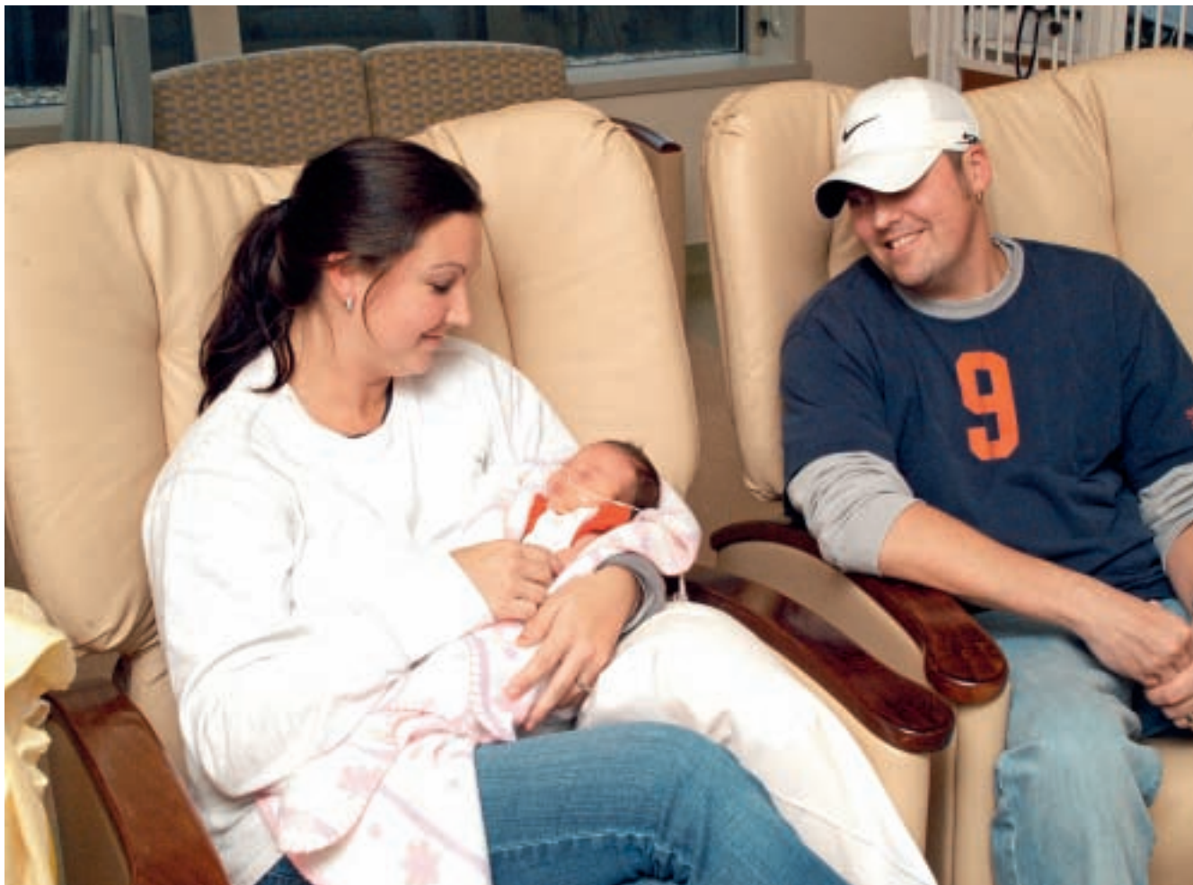
Parents with neonatal patient who experienced IRDS. The patient was successfully extubated after one day on NAVA.

the fact that work of breathing, peak pressures and \text{FiO}_2 all come down, almost immediately. In this case, the respiratory rate did not increase; he was tachypneic and stayed tachypneic.