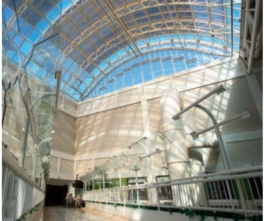
The University of Alberta Hospital in Edmonton is one of Canada's leading clinical, research and teaching hospitals.

focus, and go on to NAVA from there. We hope to give the staff members the same information as we did in the earlier educational sessions, but with more of a pediatric/neonatal focus. ■